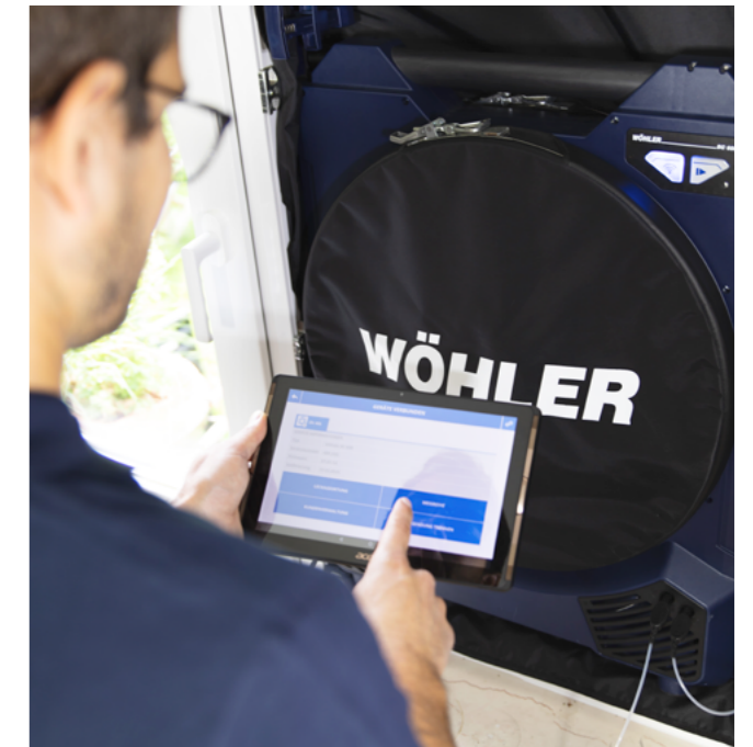
Standard-compliant Blower Door Measurement Measuring method according to ISO 9972, EN 13829 and common country-specific standards. Under- and overpressure measurement with flow rates up to 6000 m 3 /h without having to turn the fan unit.