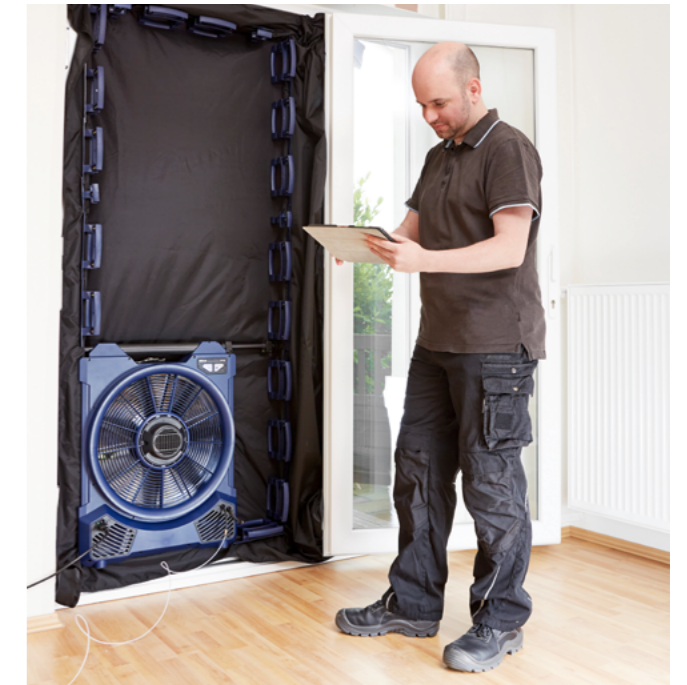
Control via App Completely guided measurement thanks to the Wöhler BC 600 App - available on Android, iOS and Windows 10.