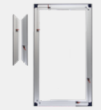
Professional Sealing set