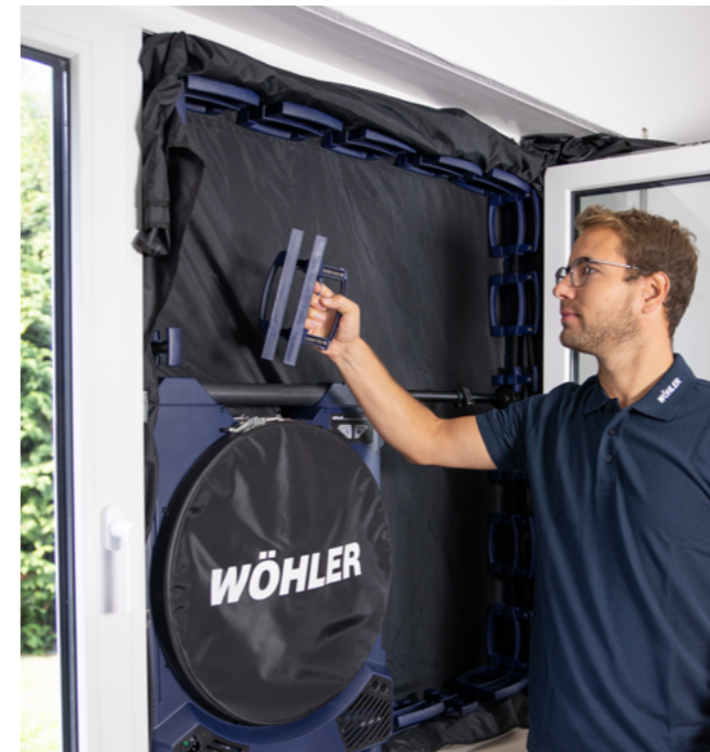
Innovative and time-saving installation No additional frame required for typical installation situations. Quick assembly due to practical clamp system - even in round or inclined window frames.