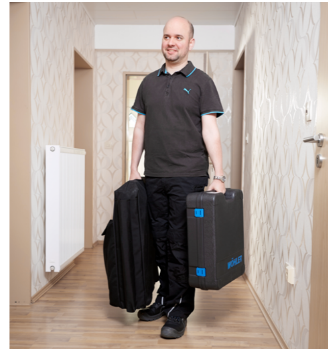
Convenient to carry Just one walk and you have everything with you. Fifth floor? No problem!