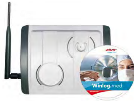
Set SI 2100 for EBI 10, EBI 100 and EBI 11