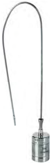
Bendable metal probe