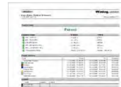
Automatic Data Evaluation