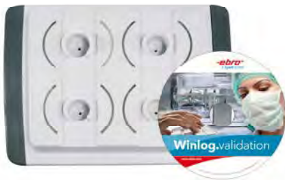
SI 3300 Set for EBI 11