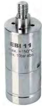
M5 thread connection