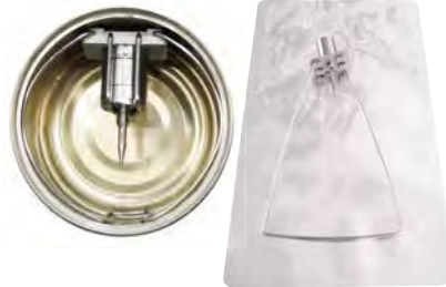
AL 114 can/bag adapter set for EBI 11-T231 and EBI 11-T233

Suitable for 3 battery exchanges; contains 6 batteries, 3 O-rings with grease and changing tools.