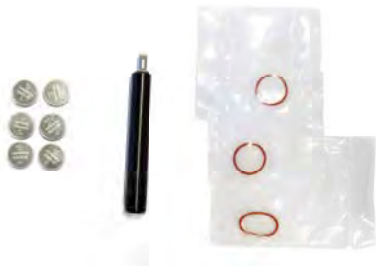
Battery change set AL 113 for EBI 11

Suitable for 3 battery exchanges; contains 6 batteries, 3 O-rings with grease and changing tools.