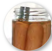
Measurement During the Process