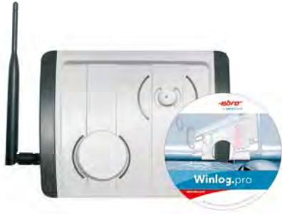
Set SI 1100 for EBI 10, EBI 100 and EBI 11