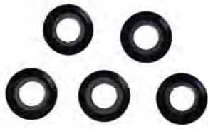
Sealing kit EBI11-Valiset

Suitable for 10 battery exchanges; contains 20 batteries, 10 O-rings with grease and changing tools.