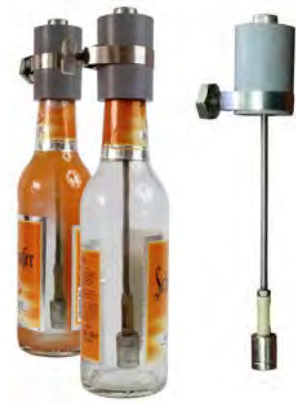
Bottle adapter set AL 115 for EBI 11-T230