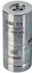
Integrated (pressure) sensor