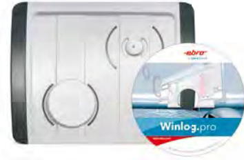
Set SI 1110 for EBI 100 and EBI 11