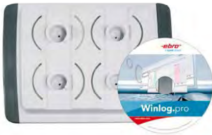
SI 1300 Set for EBI 11