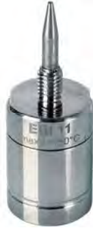
Rigid metal probe