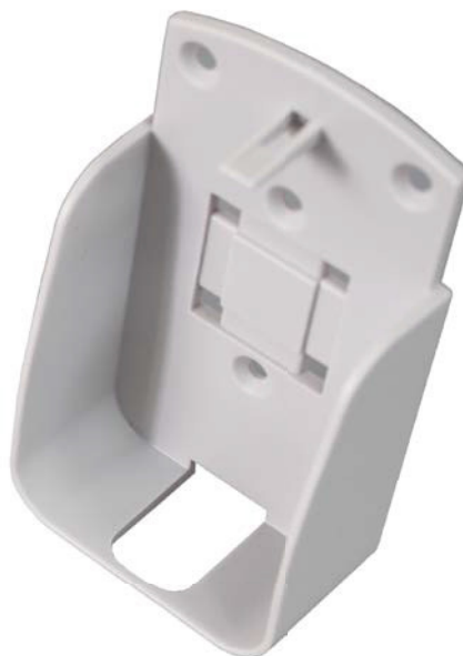
AG 152 – Wall mount for EBI 25