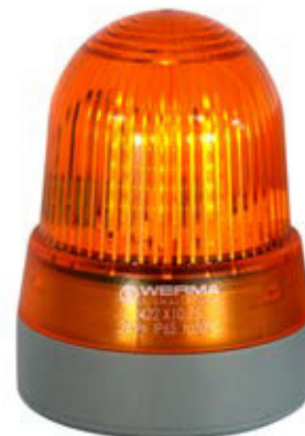
AL 251 – orange Flash Light and buzzer combination