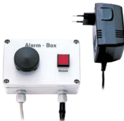
EBI 2 AB-2 – Alarmbox to connect to interface IF 400