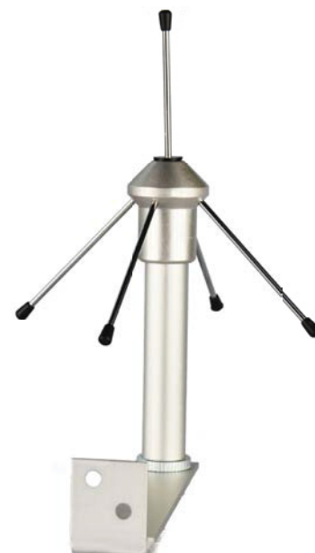
AL 116 – external antenna for the interface EBI IF 400 interface for more power, optional