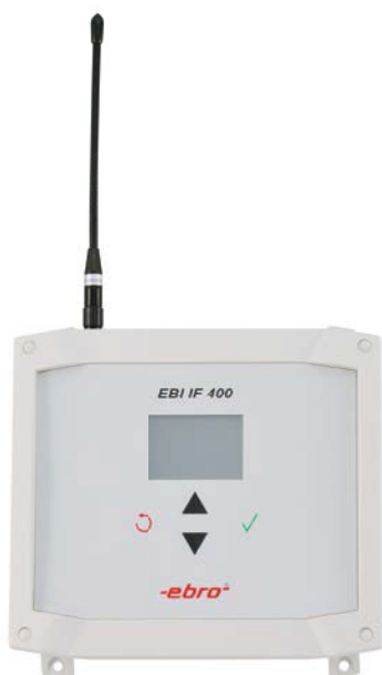
EBI IF 400 – Interface including antenna