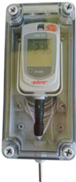
AL 250 – Protection Box for EBI 25 TE and TX