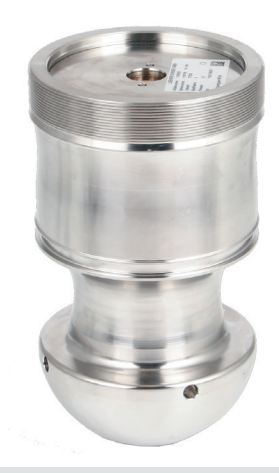
Support force transducer, model F1305