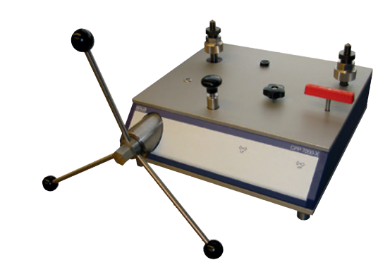
Comparison test pump, model CPP7000-X