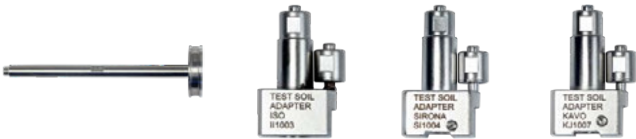
AL 3304 Central Column for thermal validation of the DAC UNIVERSAL MK IV

Developed for usage with test soil fittings supplied by SMP GmbH Tübingen.