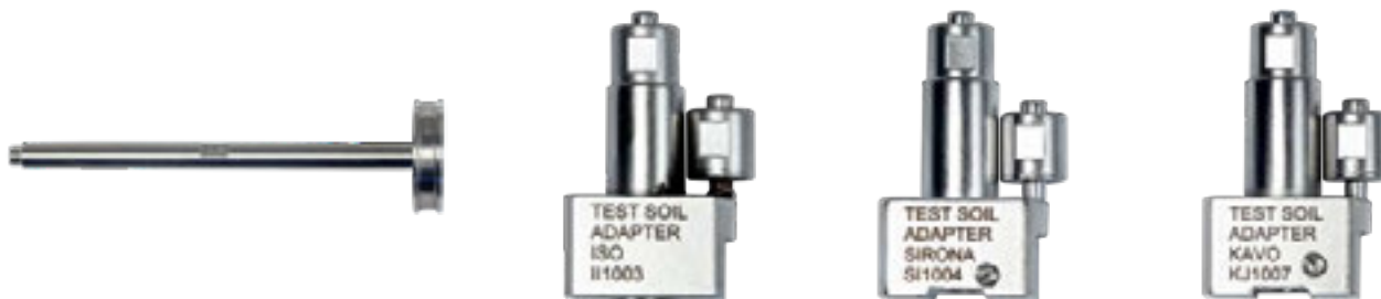
AL 3304 Central Column for thermal validation of the DAC UNIVERSAL MK IV

Developed for usage with test soil fittings supplied by SMP GmbH Tübingen.