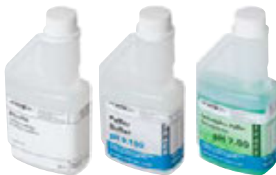
Buffer bottles Standard (DIN/NIST) buffer solutions