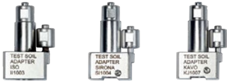
AL 3306 - AL 3308 DAC Cleaning adapters for different plugs.