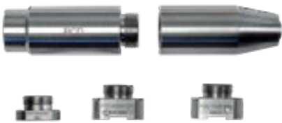
AL 3309 PCD Test Body