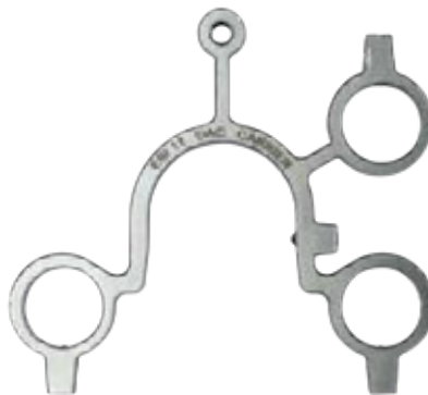
AL 3310 Logger holder