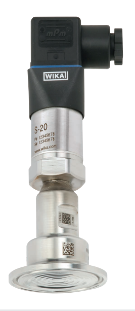
Diaphragm seal system, model DSS22T