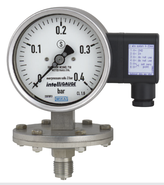
intelliGAUGE® model PGT43.100