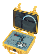
MDM50 Portable Hygrometer