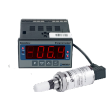
Easidew Online Dew-Point Hygrometer