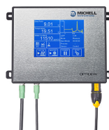
Optidew 501 Chilled Mirror Hygrometer