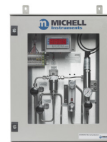
ES20 Compact Sampling System

Michell Instruments Ltd , Rotronic Instruments Corp. 135 Engineers Road, Suite 150, Hauppauge NY 11788 Tel: 631 427 3898, Email: us.info@michell.com , Web: www.michell.com/us