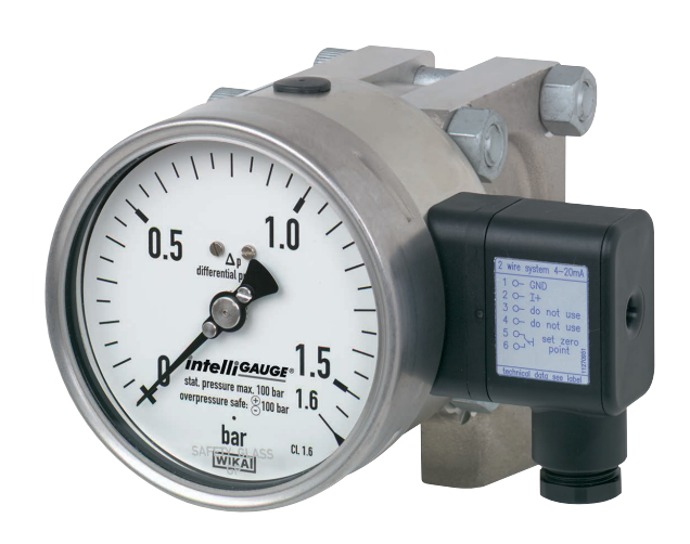
Differential pressure gauge, model DPGT43HP.100