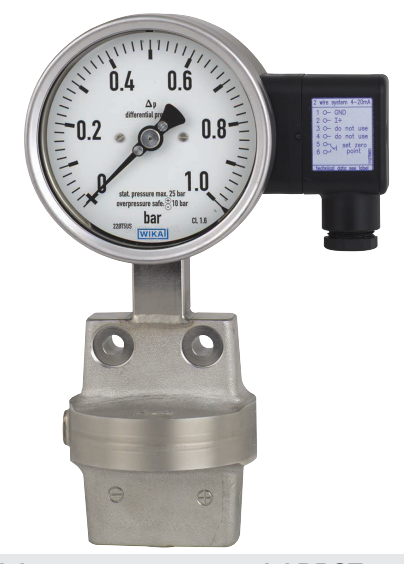
Differential pressure gauge model DPGT43.100