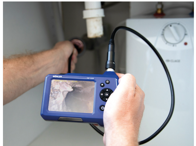
Image rotation at the push of a button

Just a Ø 6 mm opening in a tile cross is sufficient to view the installation behind the wall (in the picture Wöhler VE 320).