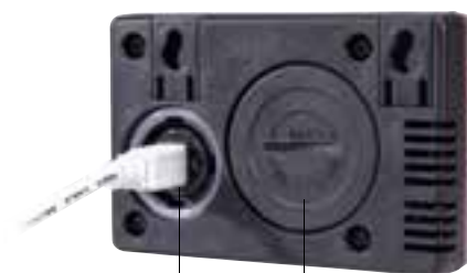
USB-Mini port (settings and data download) Battery compartment