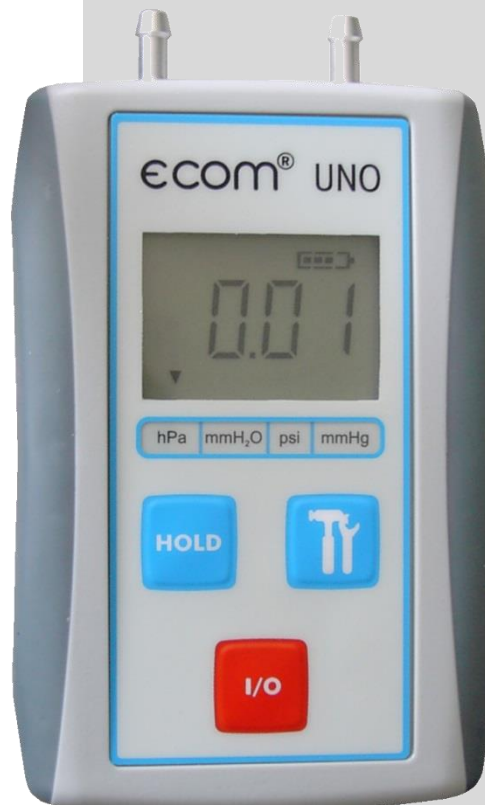
ecom-UNO in real size

FIND YOUR ECOM® SALES POINT AND DEALER ON: www.ecom.de